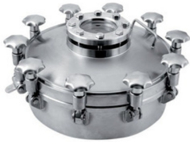
Mangatdeksel is optioneel leverbaar met kijkglas