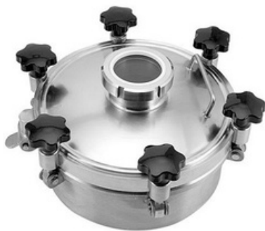
Mangatdeksel is optioneel leverbaar met kijkglas